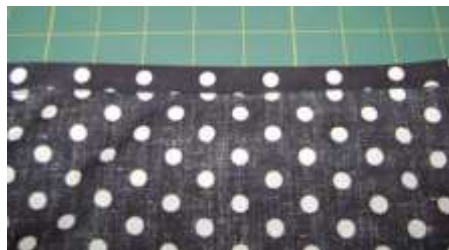
Fold over lining at top