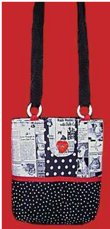
Your completed bag!