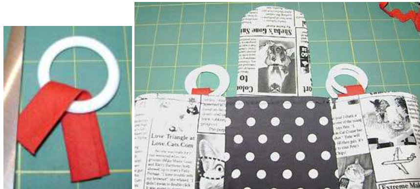
Add rings 5/8" out from center panel (polkadots panel)